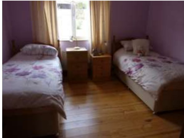
Bedroom (4): 16'4 x 13'11 Another superb room with 2 windows one a velux window. Ensuite: 11'7 x 6'10 Deep set vanity sink unit, electric shower, toilet, tiled floor, fully tiled walls, tiled floor.